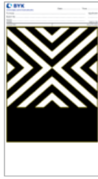
Cat. No. 2838