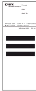
Cat. No. 2885