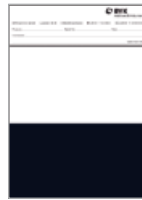
Cat. No. 2855