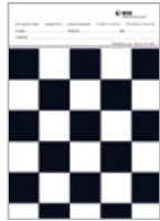
Cat. No. 2805